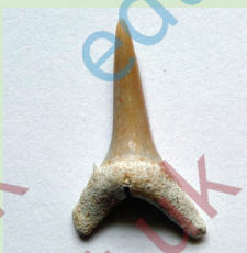
Piercing teeth to cut into small fish.