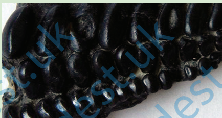
Flat teeth to crush shells.