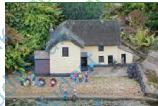
Visit Shanklin Chine, have tea at Fisherman's Cottage; play on the beach