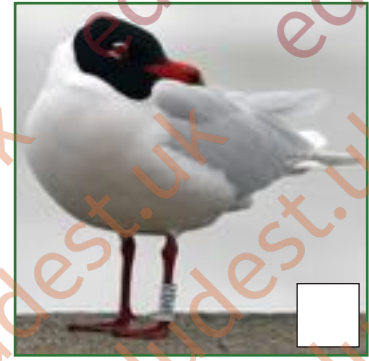
Mediterranean Gull (rare)