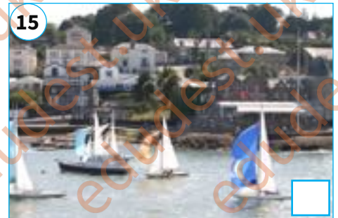
Marina & Jetties, Cowes