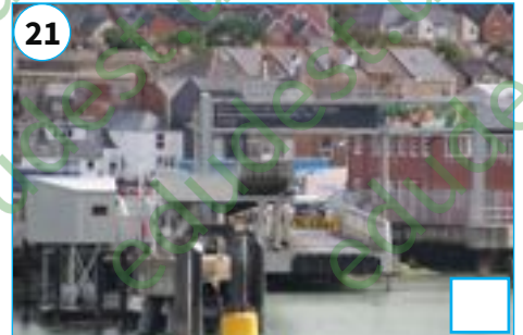
Coastguard Cottages, East Cowes