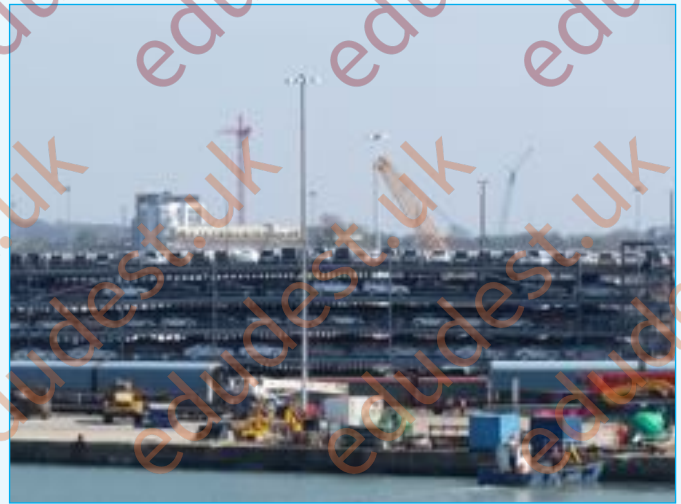
Image showing the multi-deck terminals in the eastern docks.

Its physical geography has enabled the development of a thriving port. Extensive flat land, ideal for development, lies alongside one of the south coast's largest and deepest Rias - a river valley that was flooded when sea levels rose at the end of the last ice age.