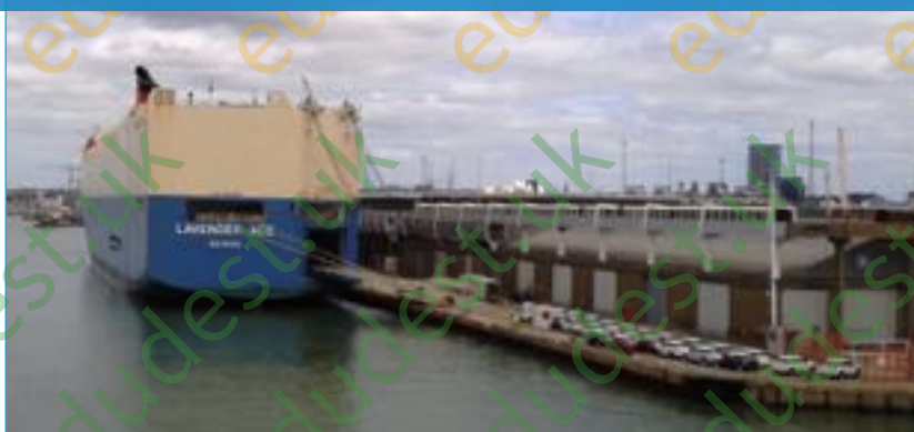
A large cargo vessel docked at Southampton's eastern docks in May 2015.