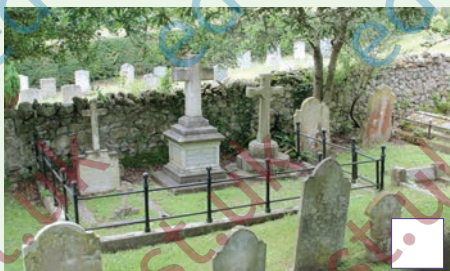
Family Burial Plot