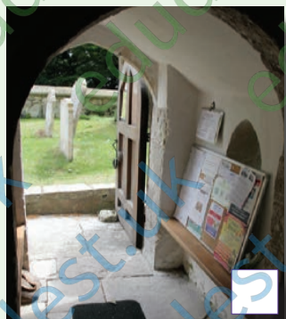
Sunday School Seat