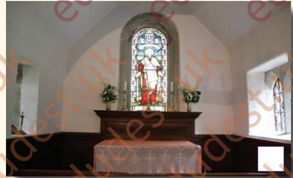
Altar and East Window