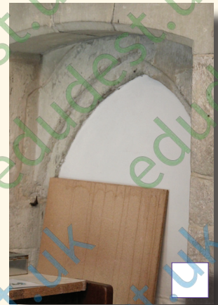
Blocked up north door