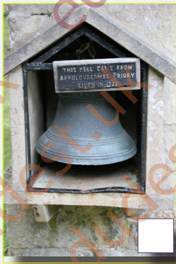
The Bell from Appuldurcombe Priory