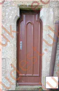
Door cut through two windows