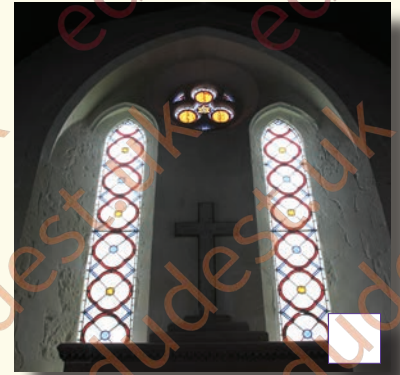
The East Window