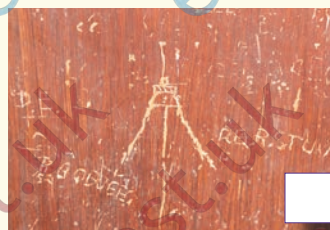
Carisbrooke Castle graffiti