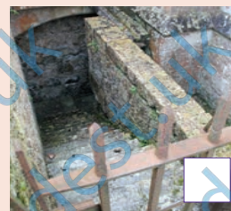
Steps to Crypt