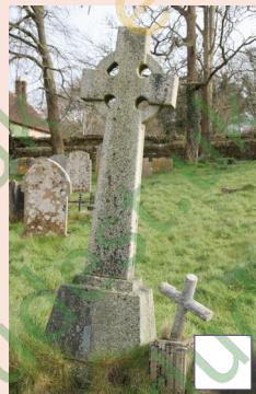
Mother & Baby crosses