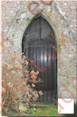
Door with mesh to stop sheep entering