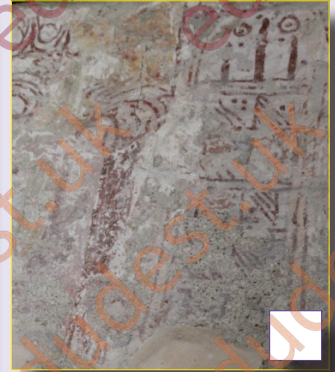
Wall Painting of Last Supper