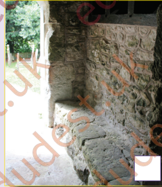
Seat for Sunday School