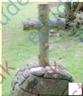
Cross made to look like wood