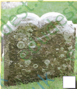
Tomb for a married couple