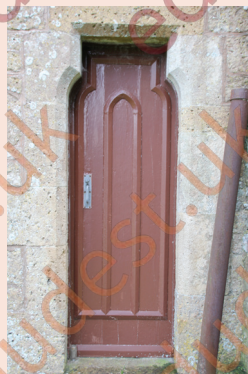
Door cut through two windows