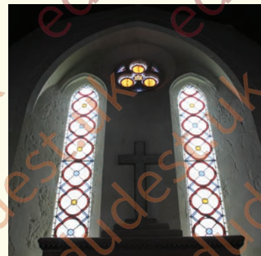
The East Window