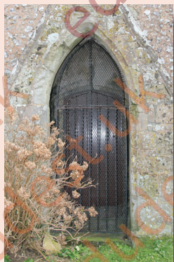
Door with mesh to stop sheep entering