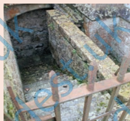
Steps to Crypt